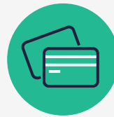
Credit Card Skimming

Identity thieves can gain access to your data in a variety of ways. It only takes one to provide them with the information they need to compromise your identity.